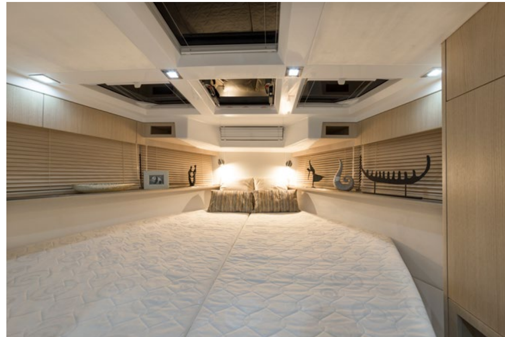
Double master bedroom —