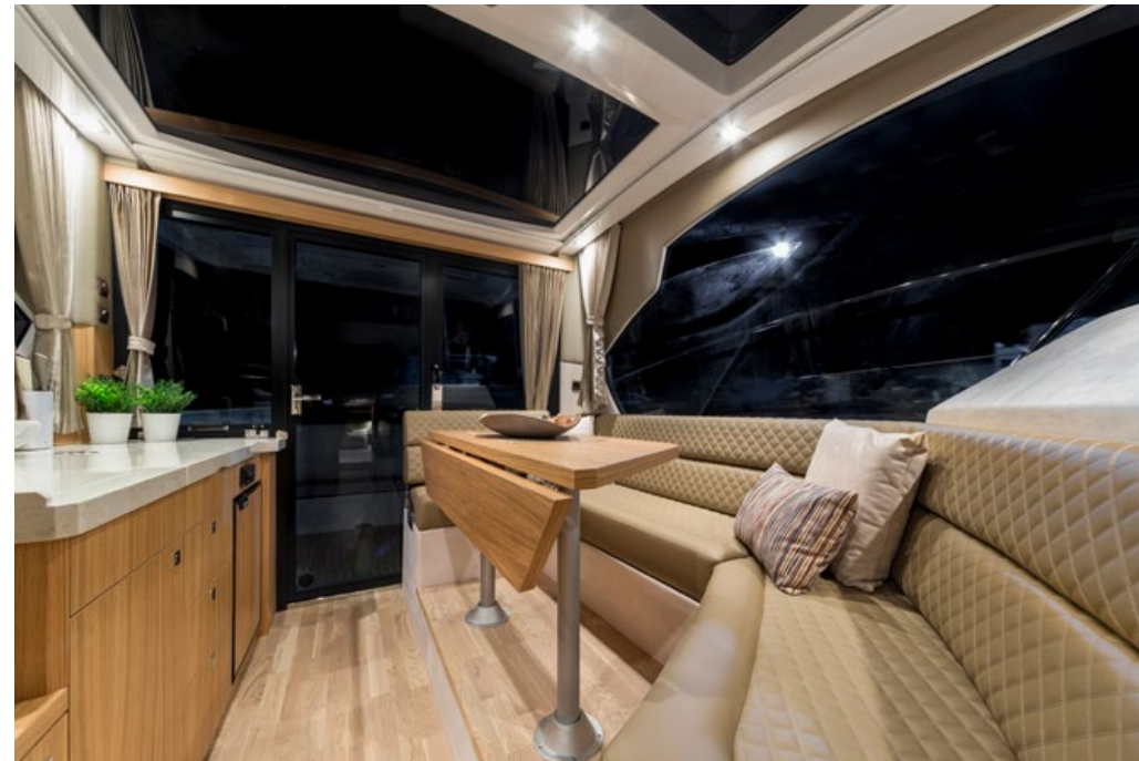
Plenty of space in the rest and dining area —