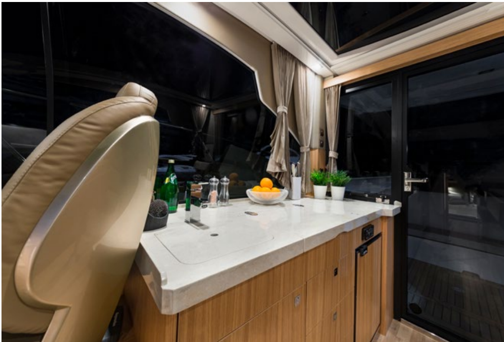
Great use of space by the compact galley area —