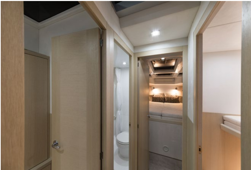
Three cabins and a bathroom down below —