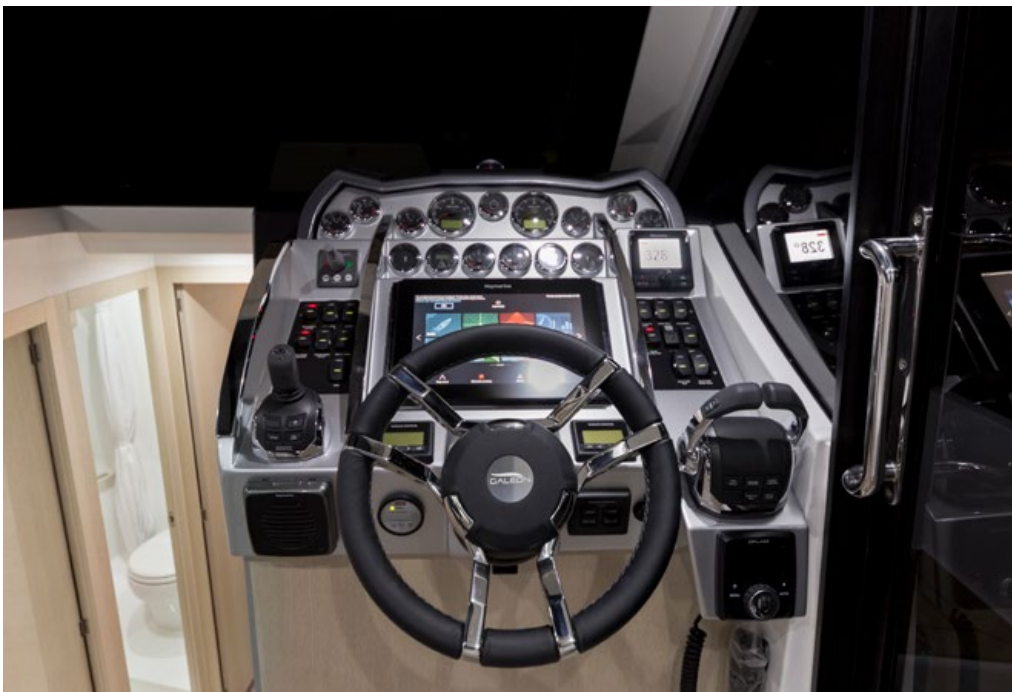
Precise handling and great visibility —