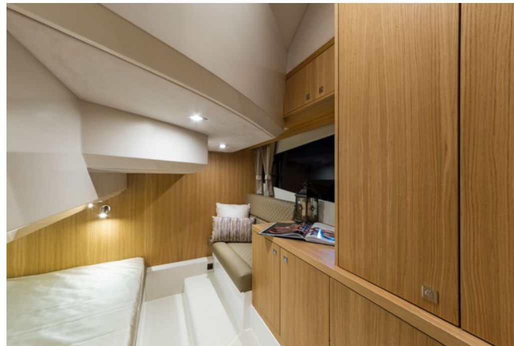
One of the three cabins down below —