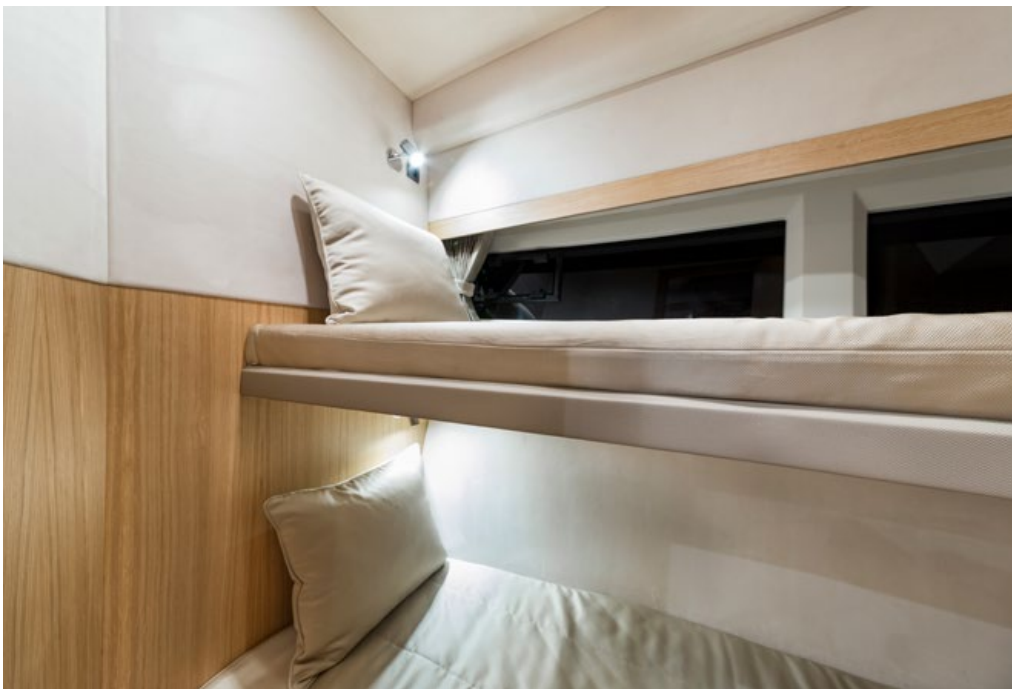
Bunk beds will please the younger passengers —