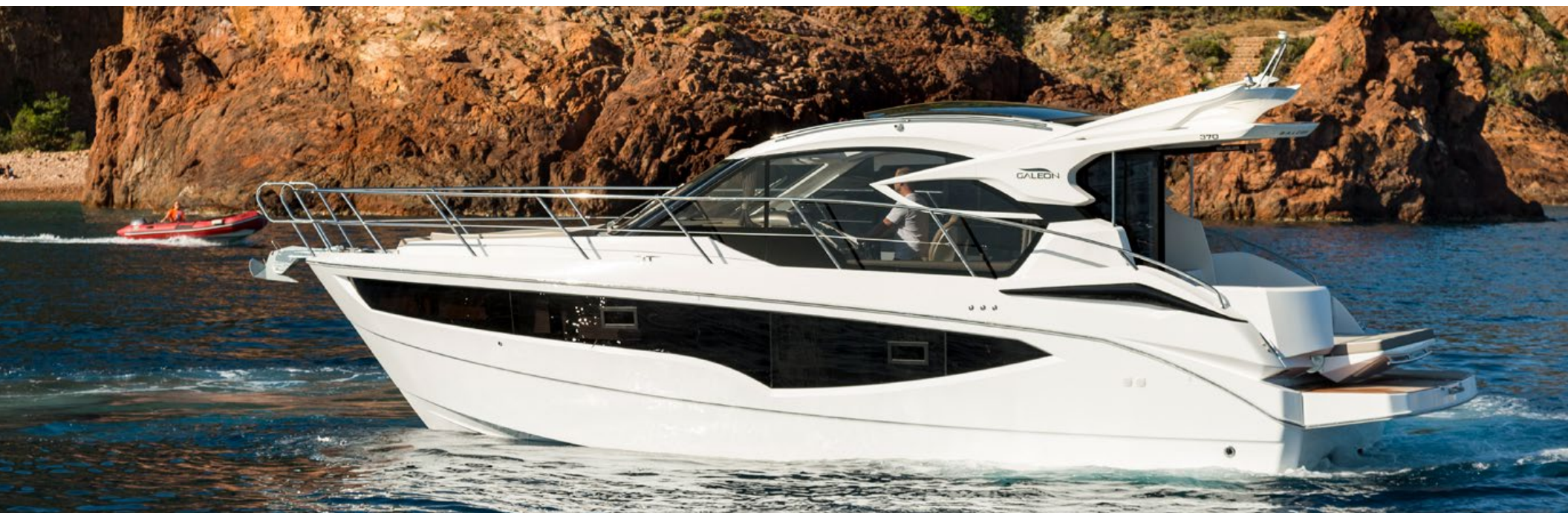
— A striking, sporty side profile of the 370 hardtop