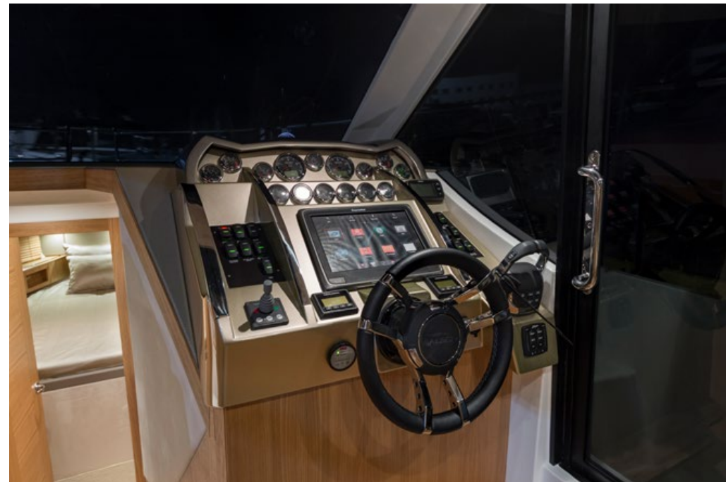
Quickly open the side door for easy bow access —