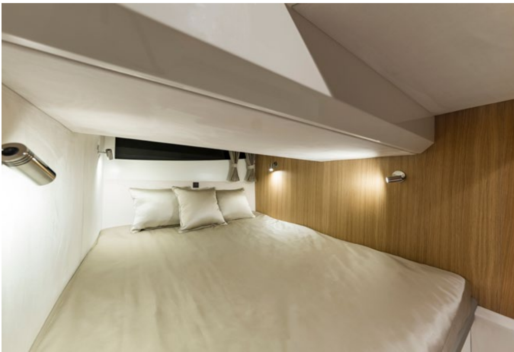
Double bed in the guest cabin —