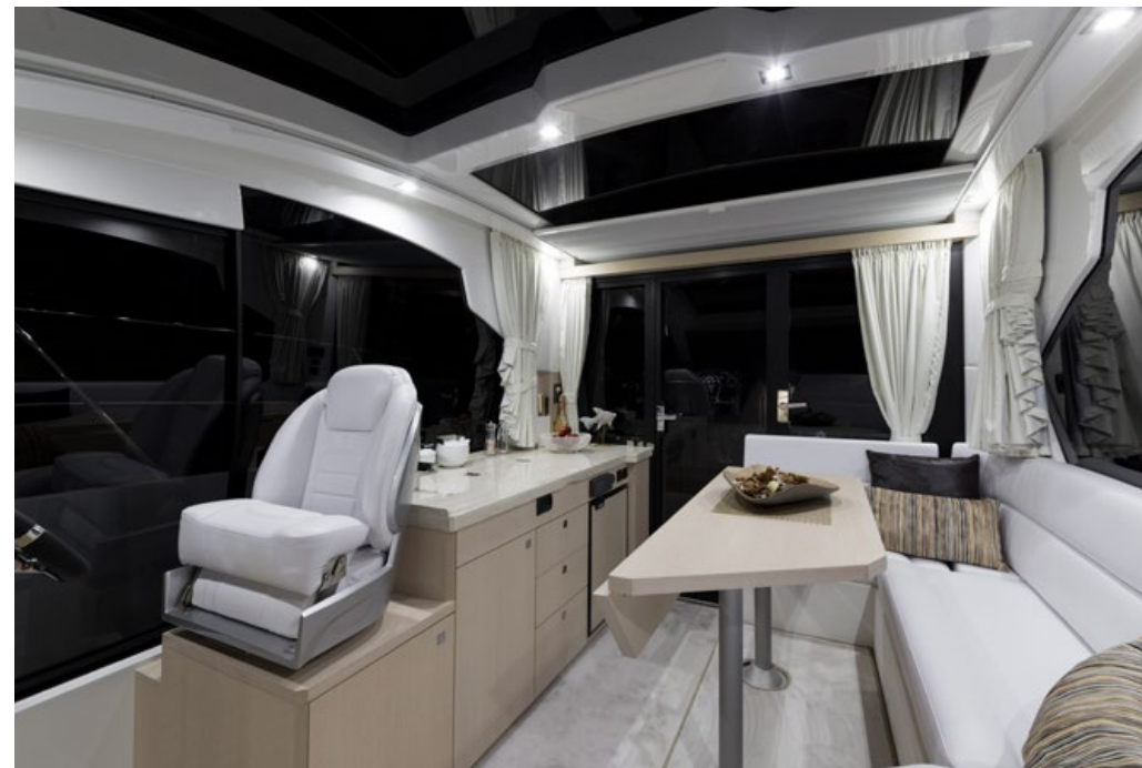
Main deck fitted with galley and dinette —