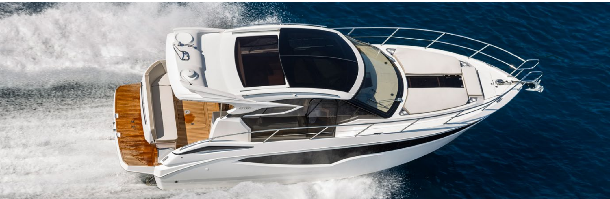
— Both the side door and the sunroof can be opened when cruising