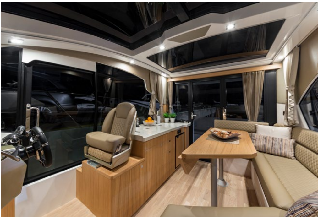
Saloon comes with a galley, dinette and a helm station —