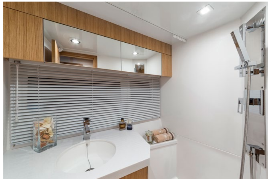
A proper bathroom for the guest to enjoy —